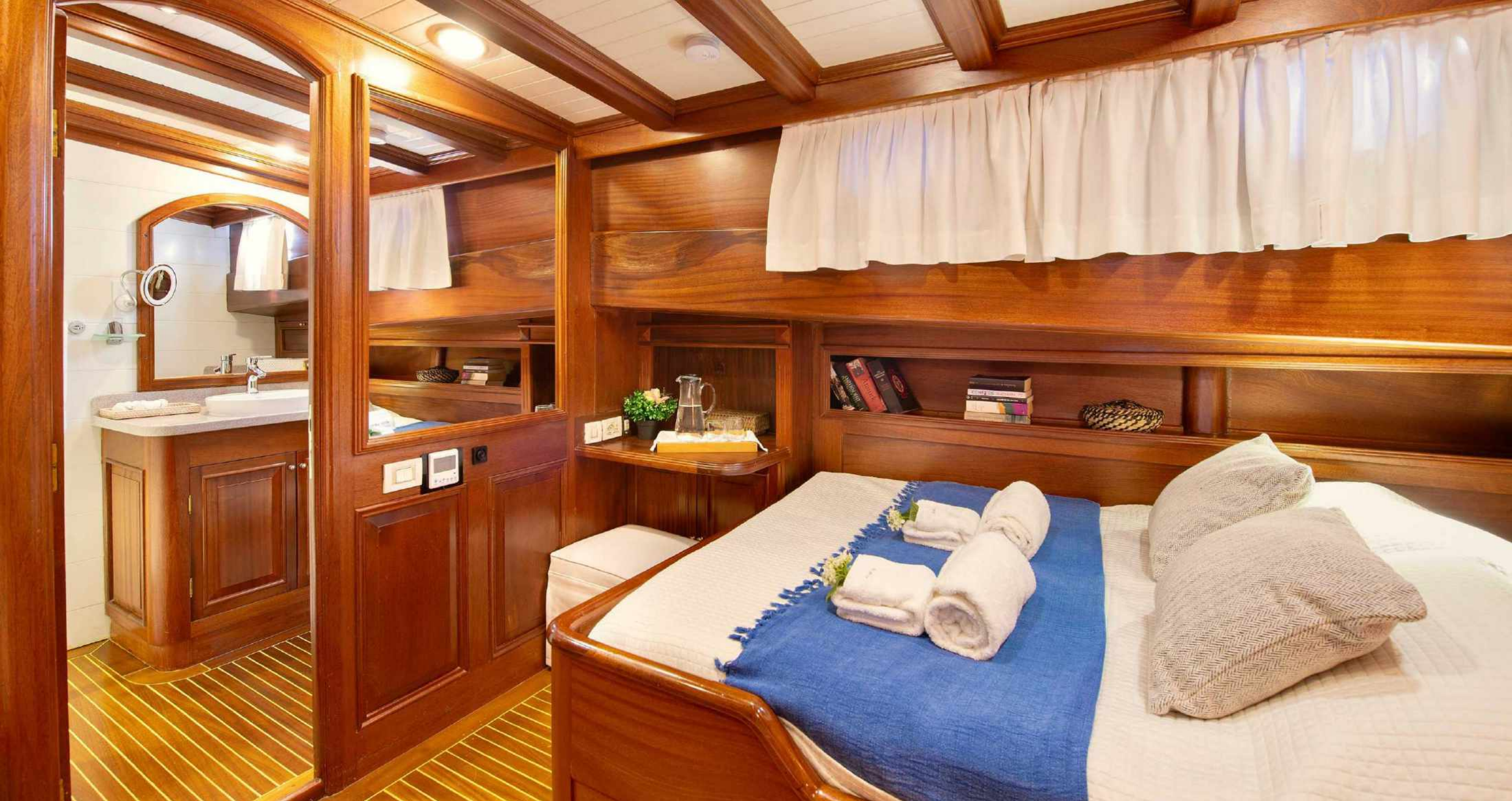
Front Right Room