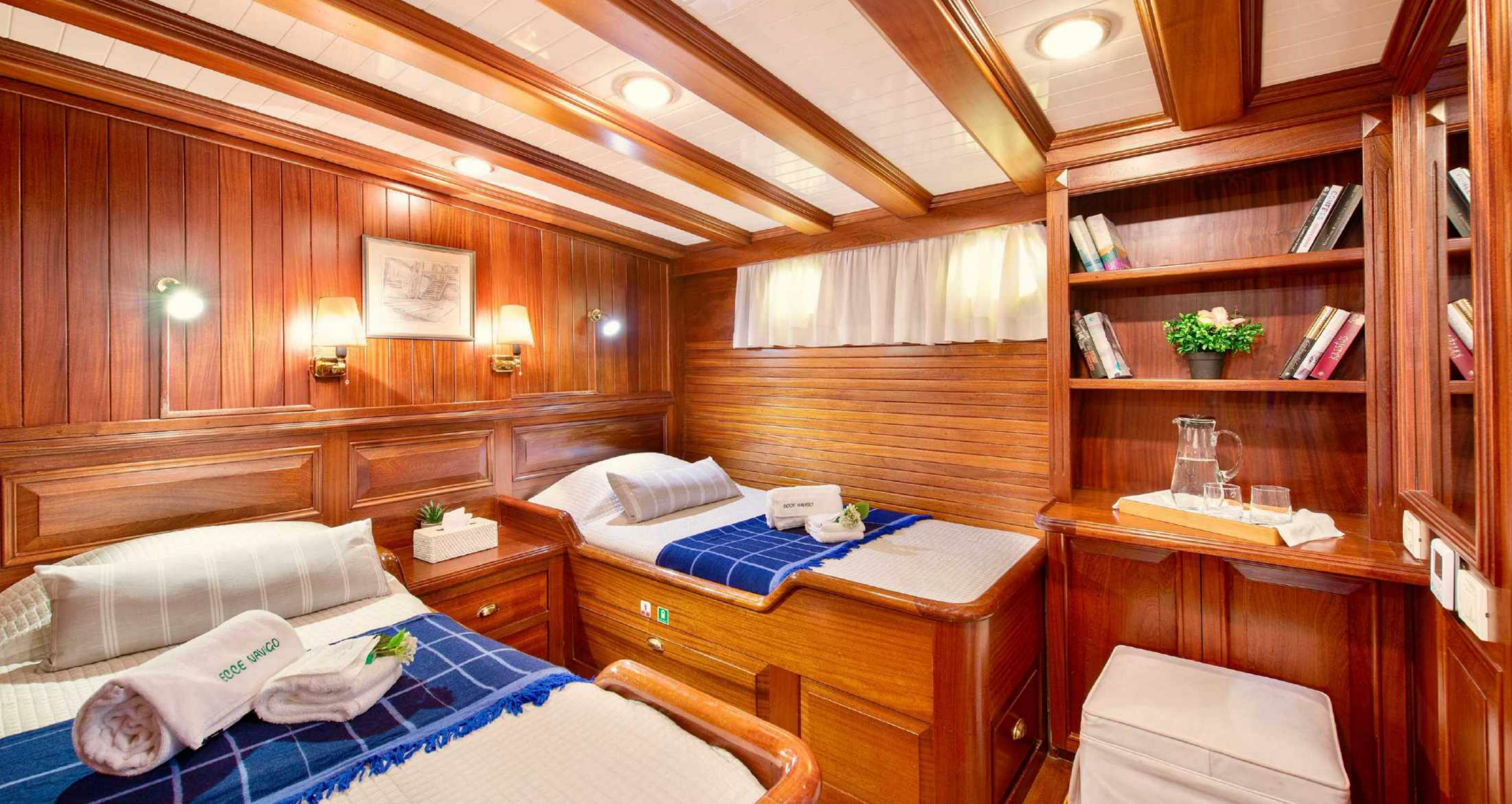
AFT Right Single Room