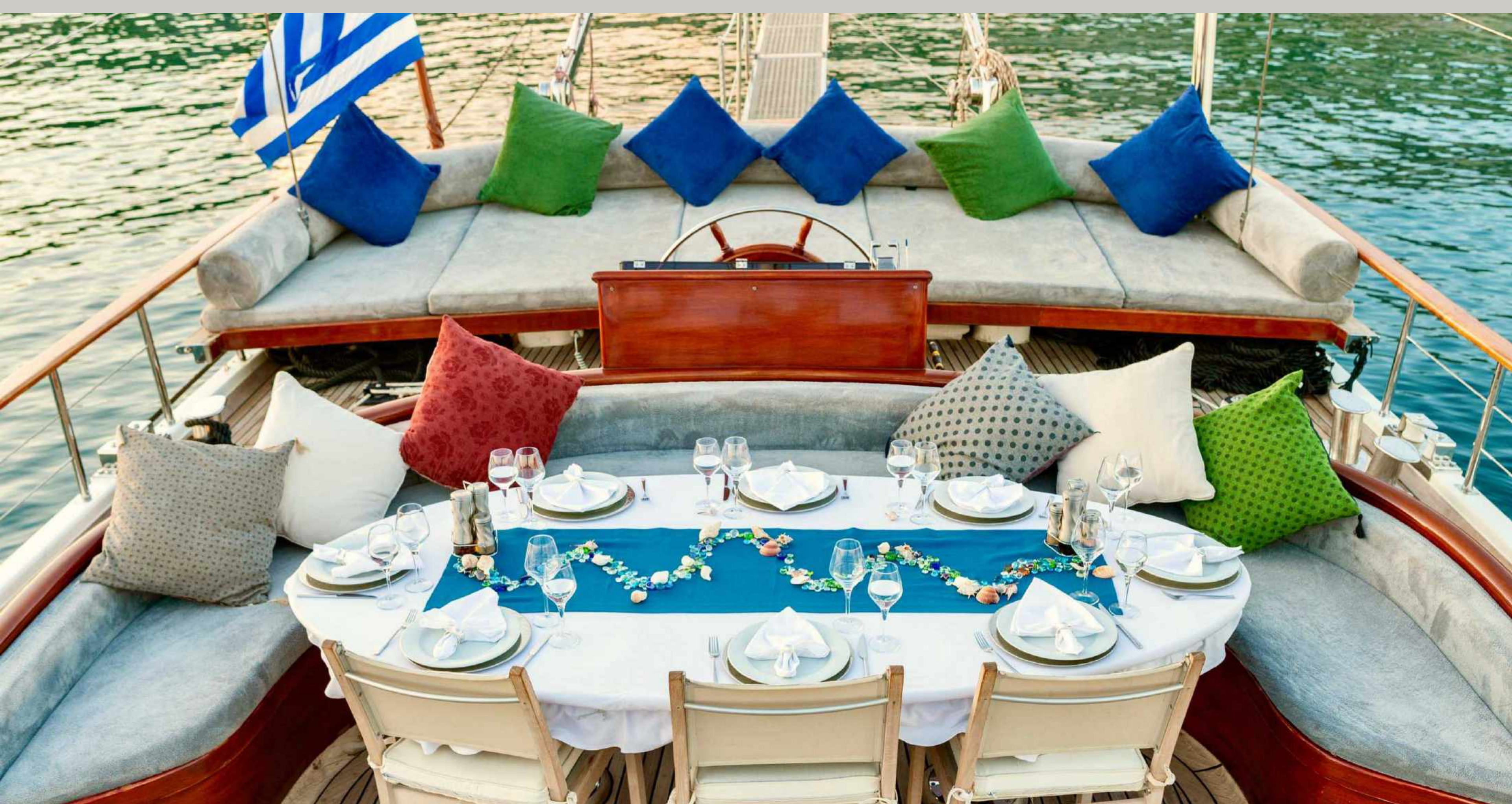
AFT Dinner Table