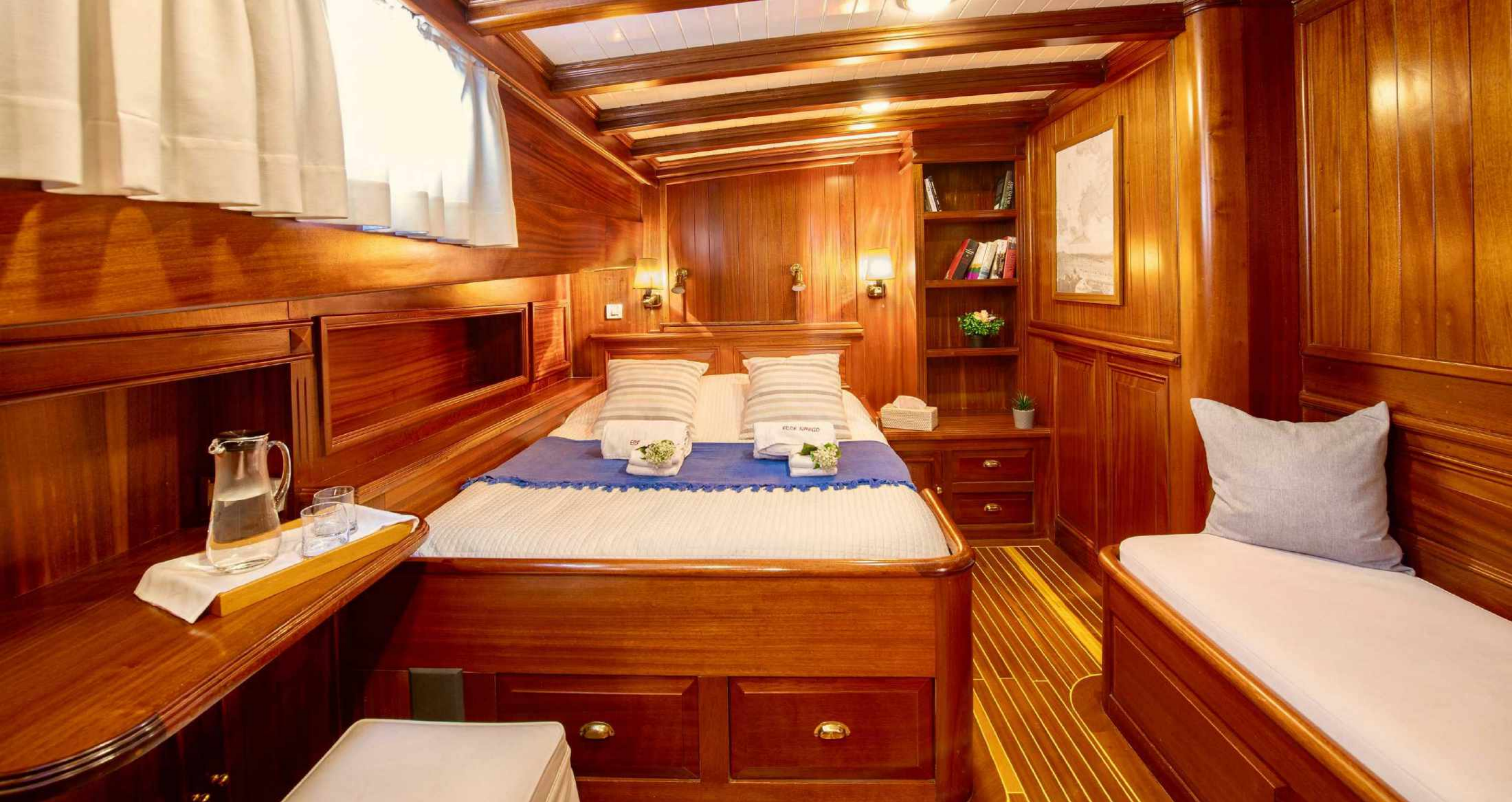
Front Left Room