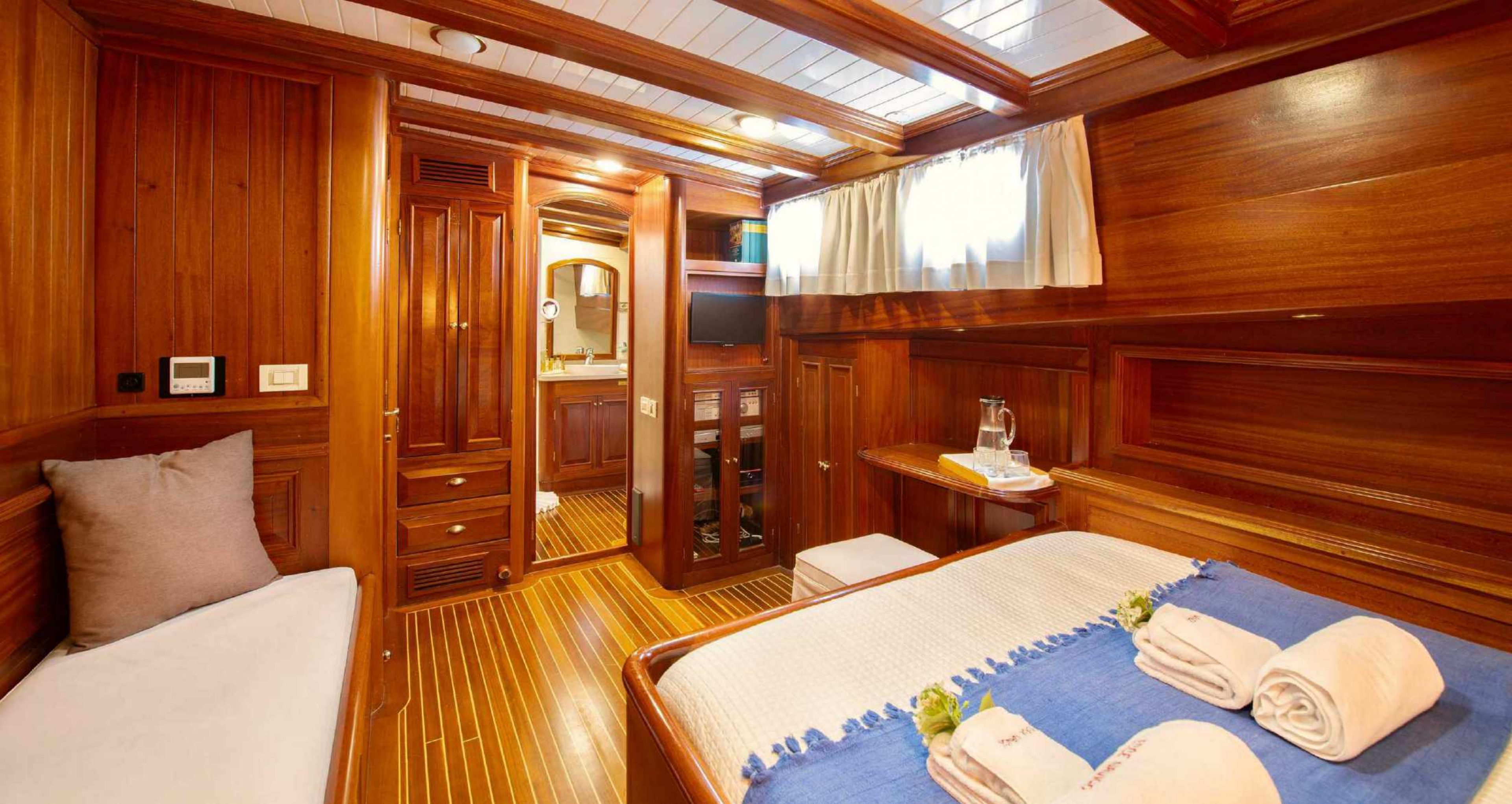
Front Left Room