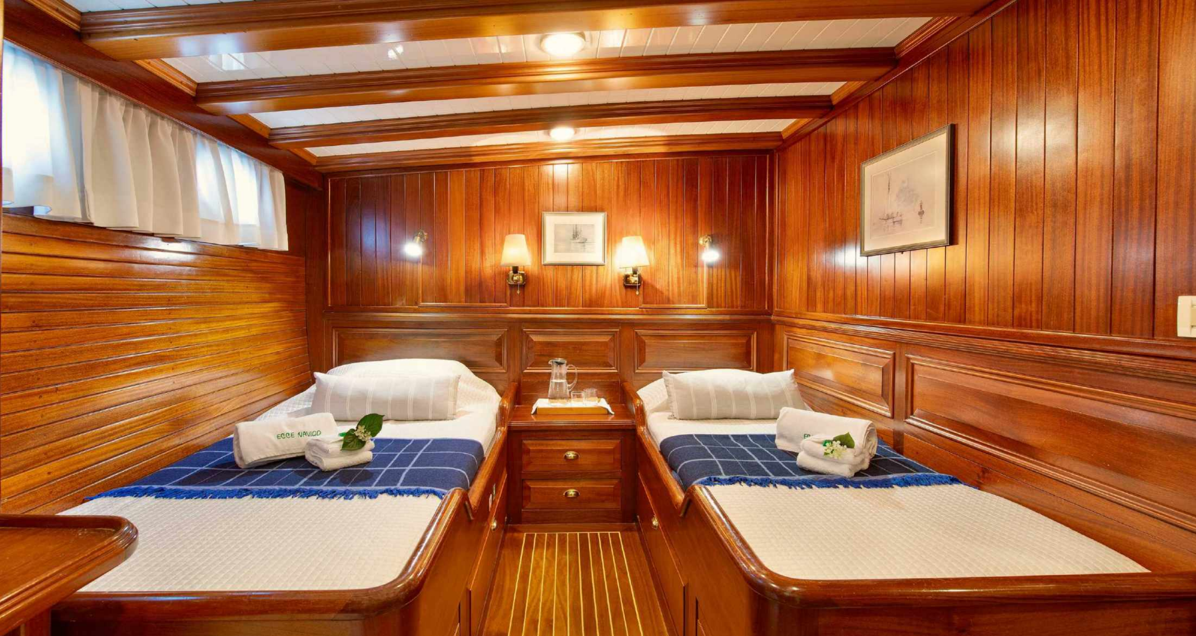
AFT Left Single Room