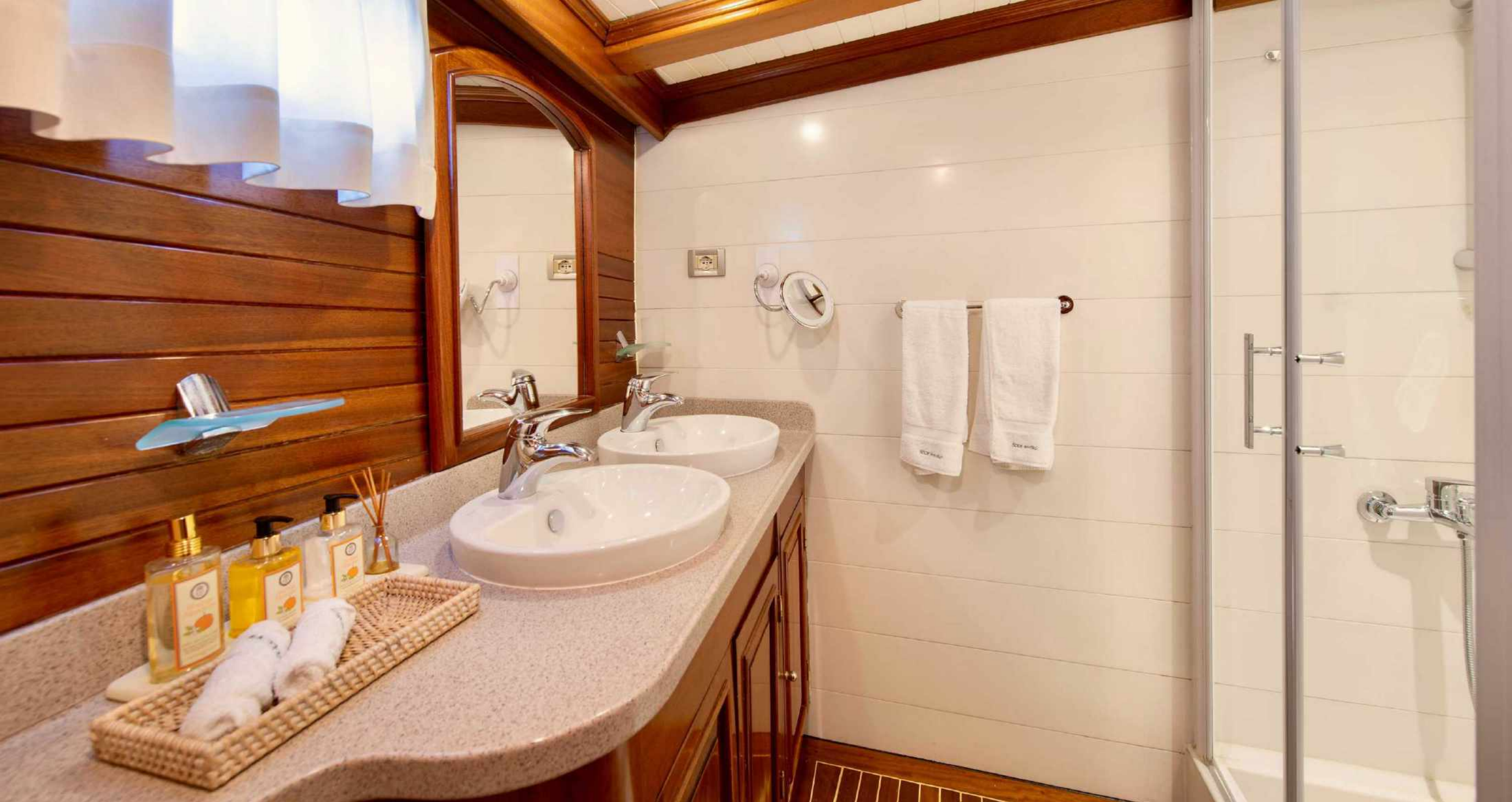
Master Room Bathroom